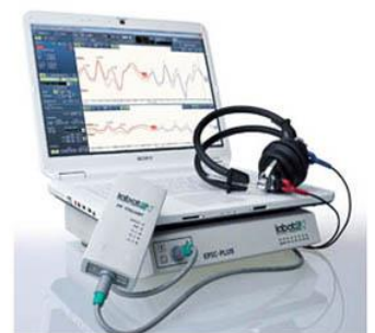
BERA (Brainstem Evoked Response Audiometry)

Palliative Care chu engge ni? – Palliative Care chu thih hlauhawm dinhmuna ding mek damlo te leh an chungte'n, nuam leh hahdam zawk a an natna tawrh chhawk zangkhai leh a zual zel tur ven dan kawng zawn te, an taksa natna mai piah lama rilru leh thlarau lama tawrhna awm thei te enkawl hi a ni. National Programme for Palliative Care hi Mizoramah District pakua ah kalpui mek a ni.