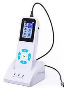
OAE Analyser (Otoacoustic Emissions)